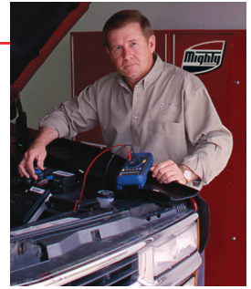
By Larry Hammer Technical Services

winter months due to the high amperage draw required to start a cold engine with thick oil, plus a battery is less efficient at colder temperatures.